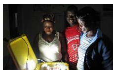
Improves health worker morale