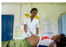
Provides fetal heart rate monitoring