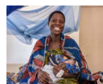
Increases utilization of maternal skilled care