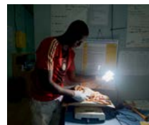
Enhances capacity to diagnose and treat obstetric complications