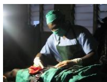
Facilitates around the clock lighting for c/sections